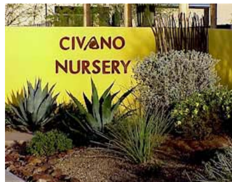
The entry to Civano Nursery's garden center in southeast Tucson, Arizona, served as design inspiration for CivanoNursery.com.

The site, redesigned by Ocotillo Design, integrates the nursery's three business lines—Garden Center, Tree Salvager, and Wholesale Nursery—within one online